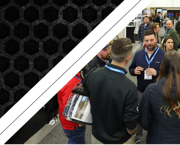
EXHIBIT HALL: OCTOBER 14–15 CONFERENCE: OCTOBER 13–15 Baltimore convention center | Baltimore, MD